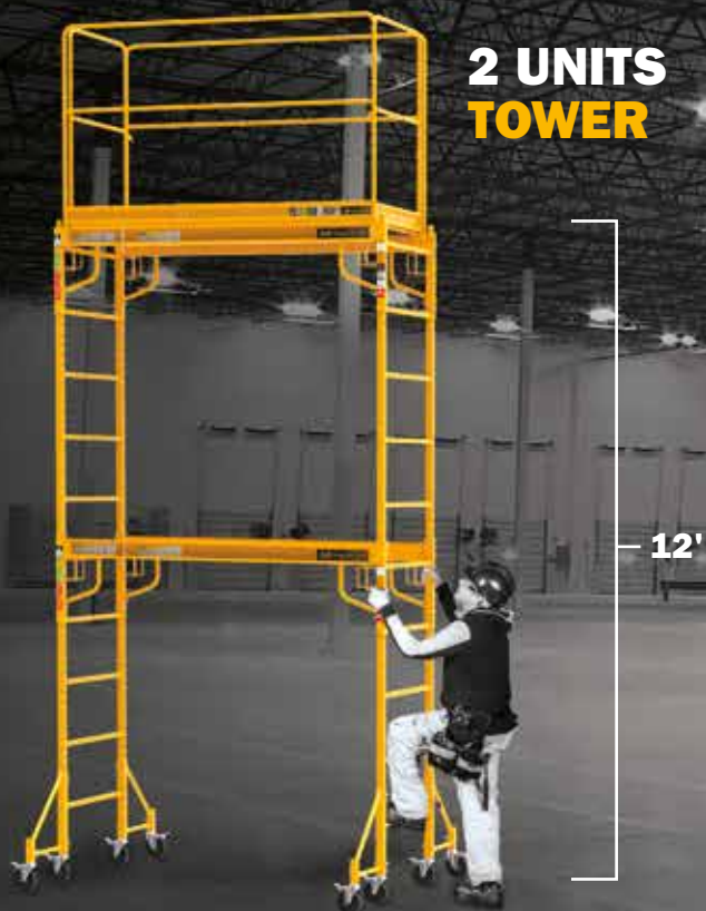
2 UNITS TOWER