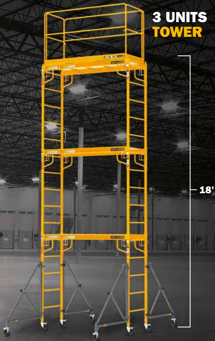
3 UNITS TOWER